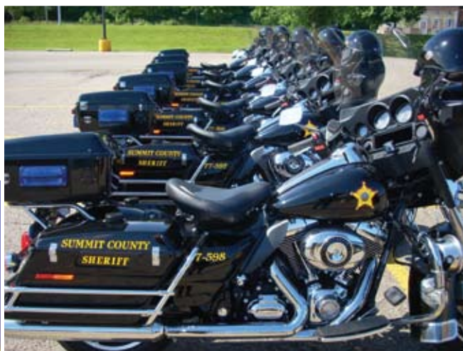
Summit County, OH – The Summit County Sheriff Dept. Motor Unit shown with their Harley-Davidson® FLHTP Electra Glide® motorcycles which are leased through Liberty Harley-Davidson in Akron, OH.