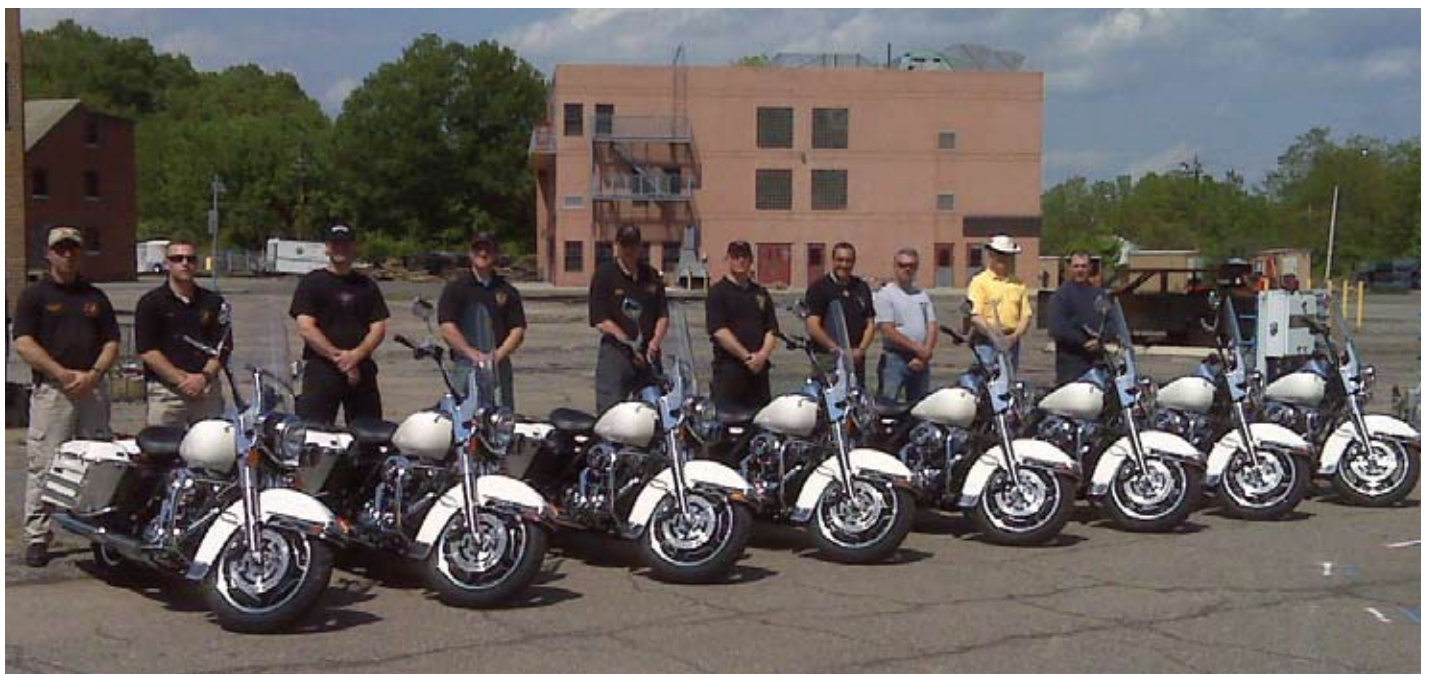
Fort Lee, NJ – The motorcycle training program is a cooperative effort between the Fort Lee Police Dept., Paterson Police Dept., Passaic County Sheriff Dept. and the New Jersey State Police. The motorcycles were purchased by the Bergen County Prosecutor's Office using confiscated funds. The school has eight new 2009 Road Kings®, bringing the total to 16 assigned exclusively to the academy to train motor officers.