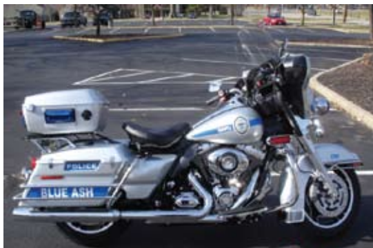
Blue Ash, OH – The City of Blue Ash, OH which is a northern suburb of Cincinnati, received its first-ever Harley-Davidson® Police Motorcycle this past year.