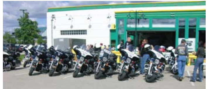
Middleton, WI – When over 100 police officers mounted their motorcycles on Aug. 22, it wasn't for a high-speed pursuit, but rather it supported the 2009 Safe Harbor Motorcycle Ride to Benefit Kids. Over 300 motorcyclists participated in the ride as they made their way throughout Wisconsin's countryside. Each participant raised a minimum of $25 which was raised for the Safe Harbor Child Advocacy Center. Safe Harbor allows victims of child abuse and their families to receive services such as a place to stay, a system of support, and recording of testimony. After the 100-mile ride, the event ended at Quaker Steak & Lube in Middleton which then hosted a buffet for all participants and sponsored a performance by Madison jazz band, The Blue Olives. More information on the Safe Harbor Child Advocacy Center can be found at www.safeharbor-dc.org .