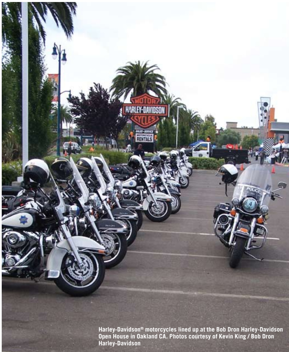
Harley-Davidson® motorcycles lined up at the Bob Dron Harley-Davidson Open House in Oakland CA.

The other beneficiaries of the day were the families of the fallen officers, with the motorcycle raffle and the Oakland