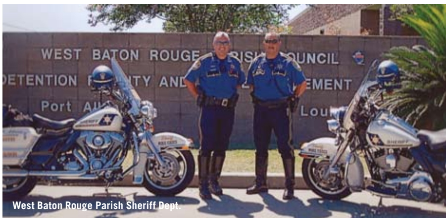
West Baton Rouge Parish Sheriff Dept.