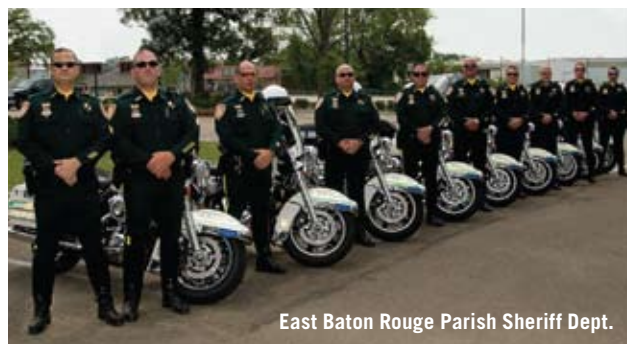
East Baton Rouge Parish Sheriff Dept.