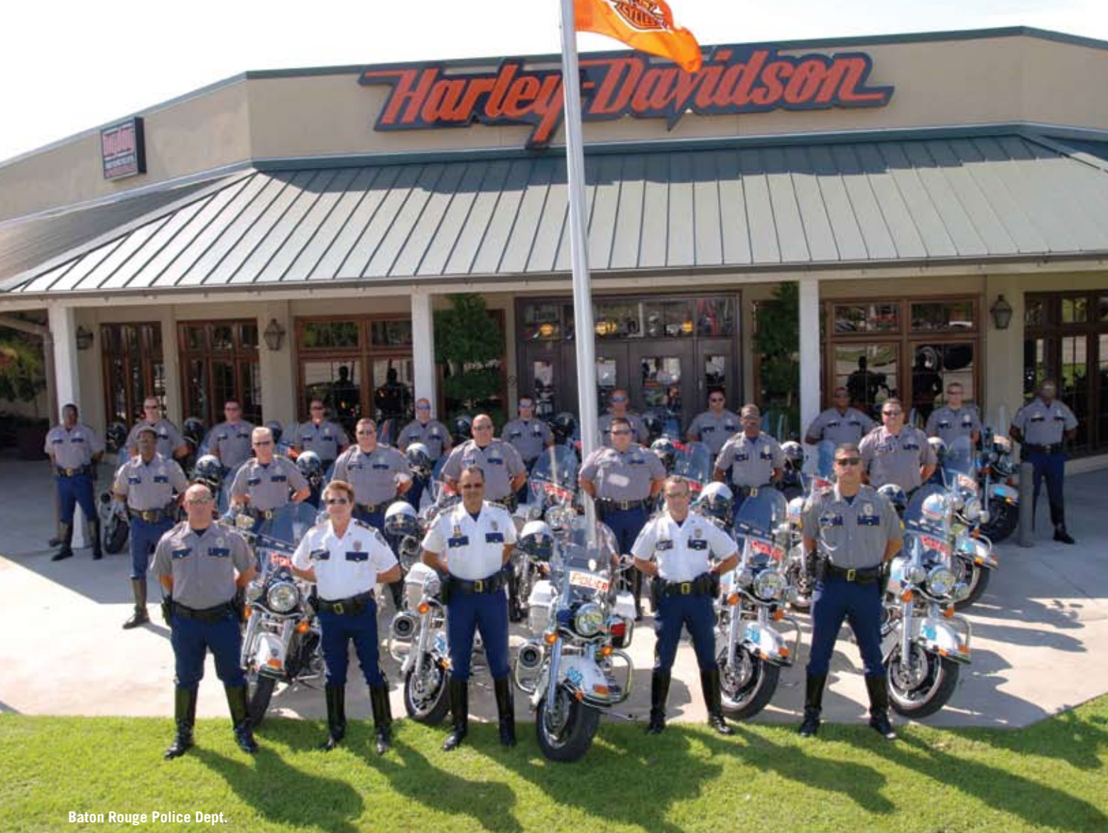
Baton Rouge Police Dept.