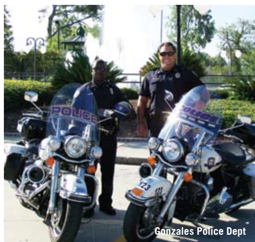
Gonzales Police Dept

Baton Rouge City Police Department. This was the beginning of what has become a very long and mutually beneficial relationship with the Baton Rouge City Police Department as well as 11 other law enforcement agencies in the