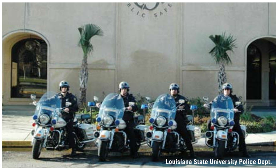
Louisiana State University Police Dept.