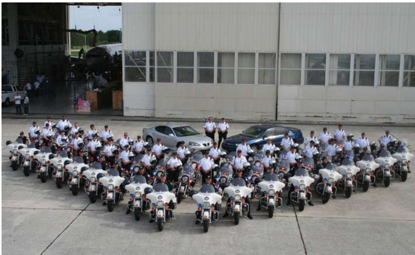
"Dream Flight" Toronto Police Motor Unit and the Orange County Sheriff Motor Unit. Orlando, Florida June 4, 2009.

It is a rare occasion to get two fully staffed motorcycle units from different countries, over 1,000 miles apart, together for a photo opportunity. The event allowed everyone to work together and help put a smile on the faces and help the children forget about their problems.