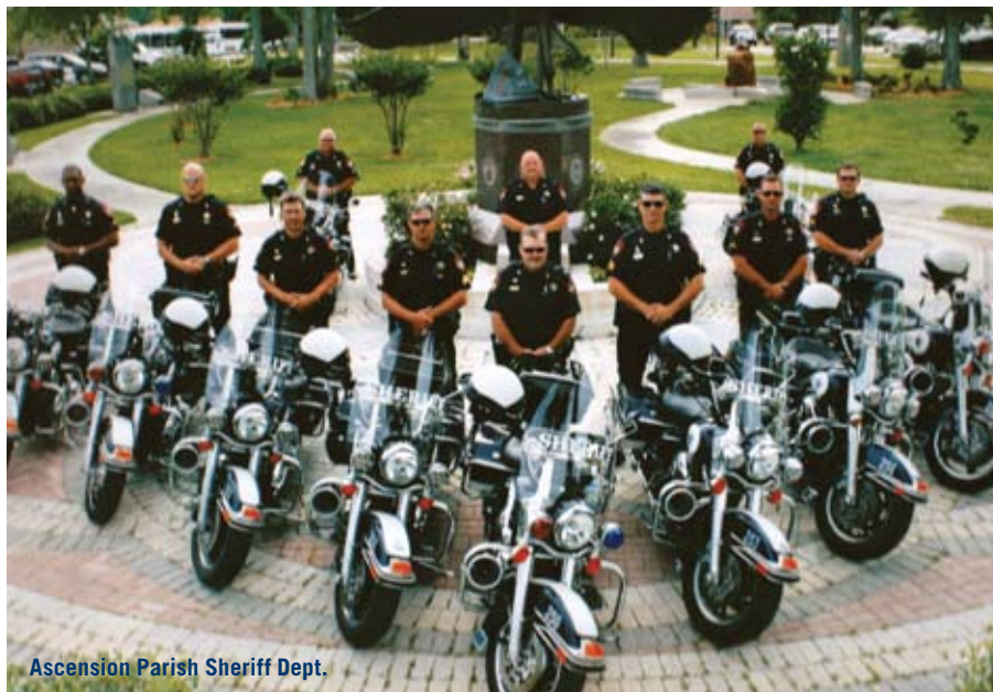
Ascension Parish Sheriff Dept.