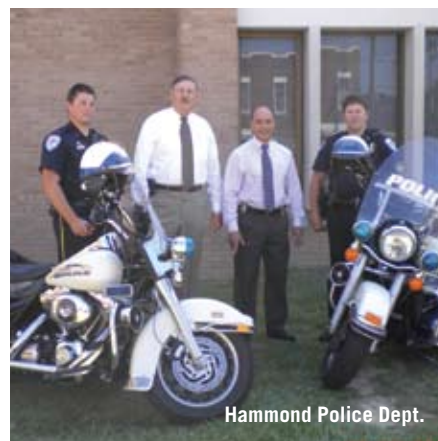
Hammond Police Dept.