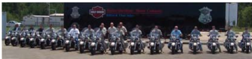
Fort Bragg, NC – The first Military Police Officer Motorcycle Training class was recently held at Fort Bragg. The training was conducted by Northwestern University Center for Public Safety and Harley-Davidson Motor Company.