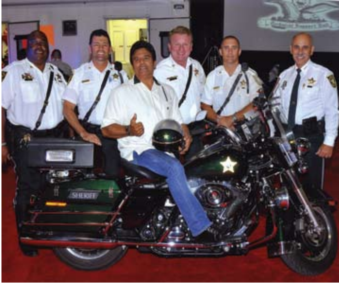
Broward County, FL – Members of the Broward County Sheriff Dept. Motor Officers pose with actor Erik Estrada at the National Sheriff's Association Expo in Fort Lauderdale FL.