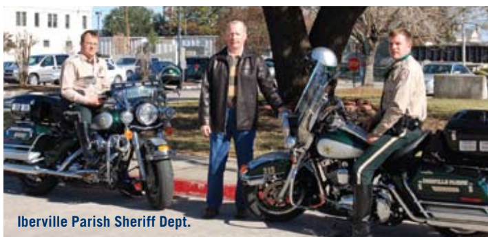
Iberville Parish Sheriff Dept.