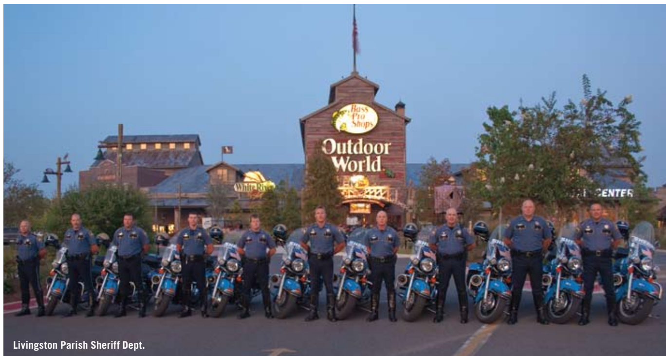
Livingston Parish Sheriff Dept.