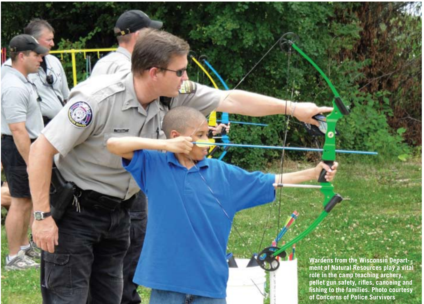
Wardens from the Wisconsin Department of Natural Resources play a vital role in the camp teaching archery, pellet gun safety, rifles, canoeing and fishing to the families.

The Wisconsin Department of Natural Resources Wardens play a vital role in this camp, teaching proper use of pellet guns, rifles, canoeing, and fishing to the kids and their parent/guardian. For some of the children, it may be the first time they have spent time with law enforcement officers since the death of their parent. For others, they get to once again enjoy outdoor activities that they may have enjoyed as a family before the death of their parent. Friendly competition, planned activities that encourage team building, and shared fun time in a camp atmosphere help families recognize that the teamwork approach will help