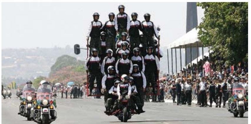
A Brazilian Army pyramid of 30 officers flanked by Harley-Davidson® Police motorcycles.