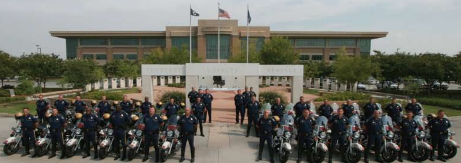
Louisiana State Police Motor Unit

GASTONIA, NC POLICE RIDE BUELL® POLICE ULYSSES® XB12XP