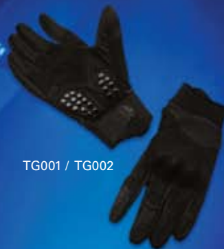
TG001 / TG002